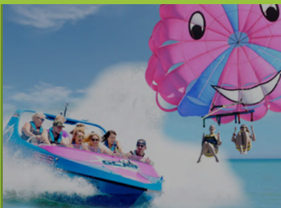
Parasailing & Jet Boating