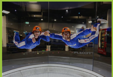
Indoor Sky Diving