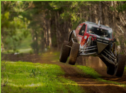
V8 4WD Buggies